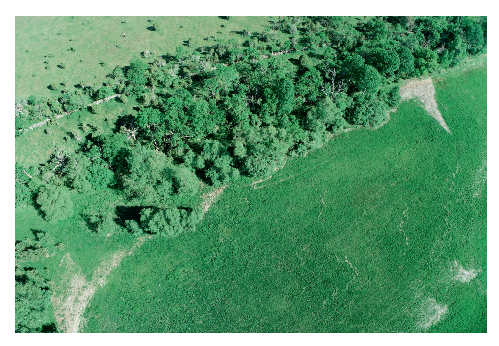
Fig. 2. Areal photograph of the area with concentration of finds, seen from northwest. Jn 2. Õhufoto leidude kontsentratsioonialast, vaade loode suunast.