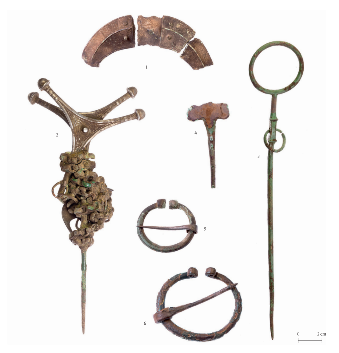
Fig. 5. Some local 8th – 10th-century ornaments from Mullutu. Jn 5. 8.–10. sajandi kohalikke ehteid Mullutust. (SM 10863: 19, 3, 1, 4, 198, 112.)

Some finds seem to originate from the other eastern coasts of the Baltic Sea. Almost certainly Finnish is an openwork round brooch from the 9th century (Fig. 6: 4; Kivikoski 1973, 92, Taf. 74). Parallels to some pendants (SM 10863: 22, 29) can be found from Semigallia and Couronia (e.g. Griciuvienė 2009, 135, 317, 339; Griciuvienė 2005, 100).