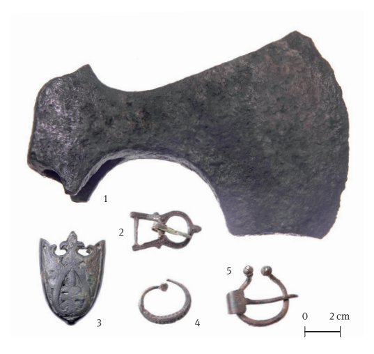
Fig. 9. 11th–12th century finds from Mullutu. Jn 9. 11.–12. saj leide Mullutust. (SM 10863: 50, 28, 25, 13, 194.)

Numerous grave goods in 12th-century cremation graves in Saaremaa have enabled a good knowledge of this period material culture, compared with the previous centuries. The more surprising was the shortage of clearly 12th-century finds at Mullutu. Still, several artefacts could be dated to the 11th–12th, or to the 12th–13th century. An axe (Fig. 9: 1), a belt buckle (Fig. 9: 2), a penannular brooch with poppy-shape terminals (Fig. 9: 5), a key (SM 10863: 238), a penannular brooch (Fig. 9: 4) or a scabbard end (Fig. 9: 3) can all be late Viking Age artefacts, or perhaps 12th-century items. 11th-13th-century penannular brooch with thickening terminals (Fig. 6: 3) is probably an import from Couronia (Griciuvienė 2009, 317, 339).