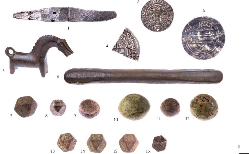
Fig. 8. Some finds from Mullutu, indicating trade. Jn 8. Kaubandusega seotud leide Mullutust. (SM 10863: 237, 183, 108, 137, 27, 186, 10, 151, 150, 77, 74, 76, 70, 71, 72, 73.)