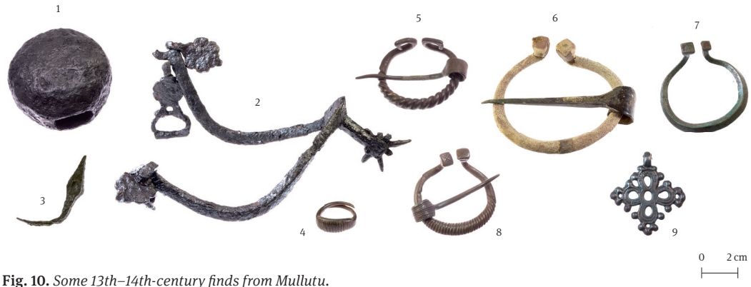
Fig. 10. Some 13th–14th-century finds from Mullutu Jn 10. 13.–14. saj leide Mullutust. (SM 10863: 36, 251, 80, 17, 20, 7, 11, 6, 247.)

Late 12th–13th-century finds connected with warriors are an arrow-head from a crossbow (Fig. 10: 3), a round sword pommel (Fig. 10: 1) and a horse bit (SM 10863: 251), perhaps also two axes (SM 10863: 60, 291) (Mandel 1991, 122; Ellis 2004, 127–128; Russow & Allmäe 2013, fig. 7).