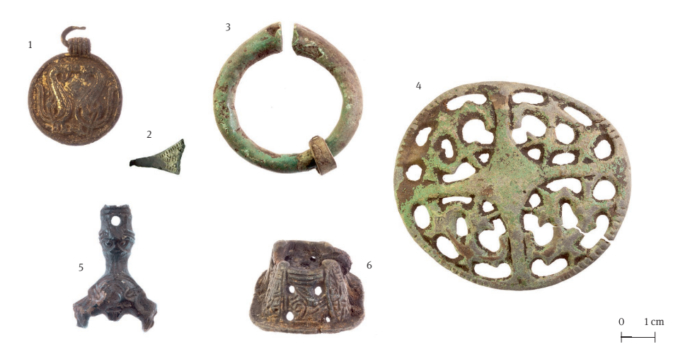
Fig. 6. Foreign artefacts from Mullutu. Jn 6. Võõrapäraseid esemeid Mullutust. (SM 10863: 26, 79, 75, 15, 24, 16.)

Viking Age weapons and riding equipment, found in coastal Estonia so far, have normally belonged to the same types as in eastern Scandinavia. The same was true for Mullutu, where it is, therefore, difficult to decide whether some weapons indicated local or foreign visitors of the site. A 10th-century stirrup (Fig. 7: 7) belonged to a type that has been represented, among other places, in Saaremaa, Birka and Hedeby (Arbman 1940, esp. Taf. 35: 1–2; Schietzel 2014, 582; Pedersen 2014, 158–163; Tvauri 2014, 185). A spur (Fig. 7: 6) probably dates from the 9th–10th century as well (compare e.g. Tvauri 2014, 186). Three spearheads of E-type were widely used weapons dated to the 9th or 10th century (Fig. 7: 1–2 and SM 10863: 142; e.g. Pedersen 2014, 92–93 and references), and a javelin head (Fig. 7: 3) to the Viking Age. 8th–10th-century arrow-heads (e.g. Fig. 7: 4 and SM 10863: 81) can be compared with similar ones in Schleswig (Schietzel 2014, 569) or in Semigallia (The Semigallians, 122). 9th–11th-century bronze scabbard ends (Fig 7: 5) were, as all other weaponry types found at Mullutu, widespread in Saaremaa, but also in other areas, e.g. in Couronia (Kazakevićius 1998, 290– 291; Tomsons 2018, 168–169).