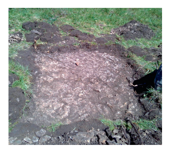
Fig. 4. The natural ground in the excavation no 1. Jn 4. Looduslik pinnas kaevandis nr 1.

Mapping the area with navigation instruments resulted in a digital elevation model indicating a steeper slope along the 100 m long stretch of the former shoreline. The steep slope ended on both sides with clear and abrupt cuts, suggesting that the natural landform had been further shaped by human activity in order to create better conditions for vessels to land. Along the steeper seashore and further towards northeast runs a low beach-ridge, the result of a storm event before the site was taken into use, which presumably offered protection from winds. The thin cultural layer with charcoal, animal bones and some ceramics behind the ridge, right northeast of the steepened part of the shore, indicated human activity, probably camping places or perhaps some light buildings. This area of approximately 0.6 ha was the concentration area of finds. A great number of finds were also recorded along the steeper part of the coast, as well as in some places further southwest.